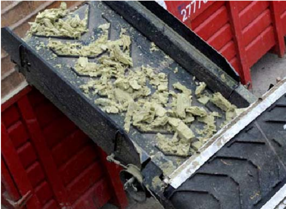
Figure 4: Separation of mineral wool from steel fraction (Eurobond)

Composite panels of all sizes can be fed into the shredding machine shown in Figure 3. All mineral wool composite panel waste can be handled using this system, which allows for a more flexible range of geometry of the panels as they do not need to be cut down in size. The shredder separates the steel from the mineral wool and deposits it into individual containers for compression prior to delivery to Rockwool or Corus. This process ensures that the minimum amount of transport is required, leading to an environmental and financial benefit. Mineral wool and steel are separated via a magnetic belt. The current capacity of the facility for recycling is approximately 2,000,000m 2 of panels per year.